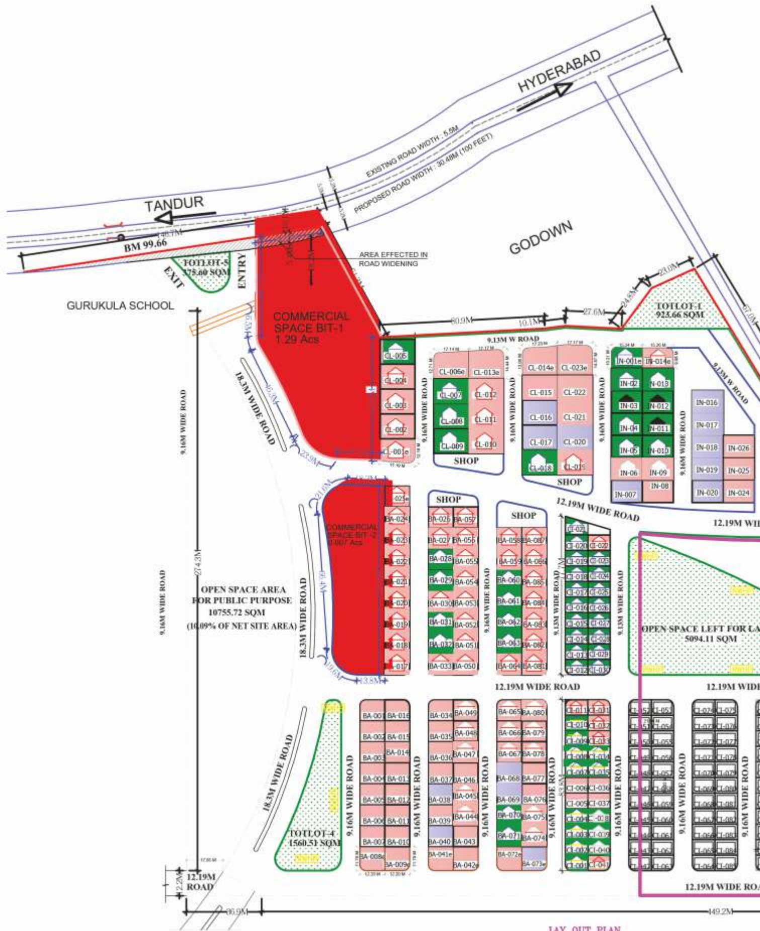
LAY OUT PLAN (SCALE=1:500)