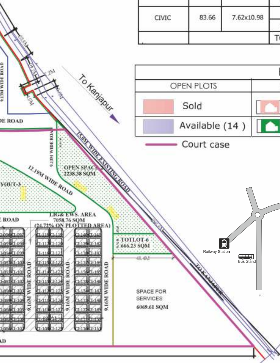
MANOHA TOWNSHIP - TANDUR - ROUTE MAP